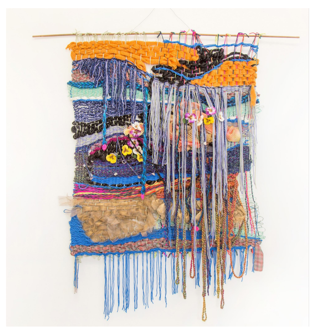
Gloria Gem Sánchez Nocturne Before Dawn, 2018 Yarn, fabric, hair, faux flora, found materials 50 x 40 in (127 x 102 cm) © 2021 Gloria Sánchez